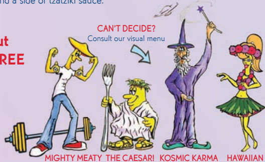
MIGHTY MEATY THE CAESAR! KOSMIC KARMA HAWAIIAN